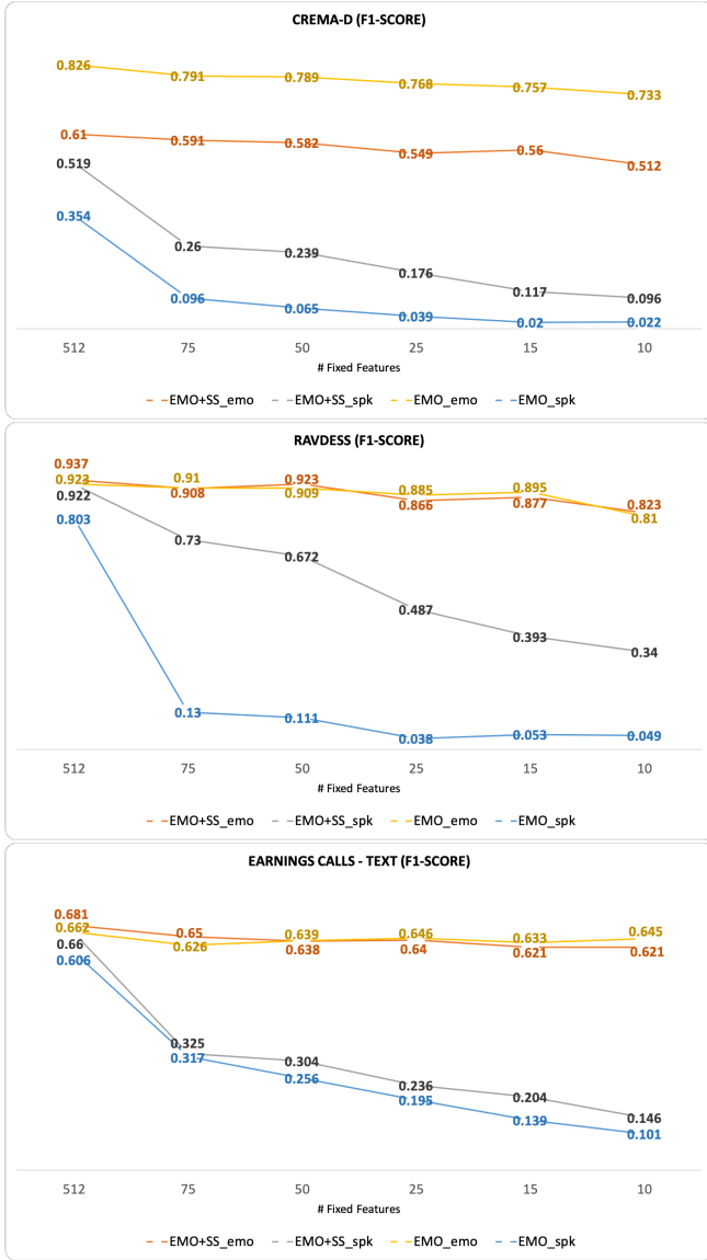
Figure 3: Suppression of speaker identification after embeddings shuffling. We show the number of fixed (unshuffled embedding dimensions) on the x-axis, ranging from 512 (no shuffling) to 10 (502 features shuffled). (i) EMO + SS emo (dark orange) is F1-score for emotion detection based on adversarial training embeddings; (ii) EMO emo (dark yellow) is for emotion detection w/o adversarial training; (iii) EMO + SS spk (dark grey) is F1-score for speaker identification with adversarial training; (iv) EMO spk (blue) is for speaker identification w/o adversarial training.

identification metrics are much higher on the RAVDESS dataset than the CREMA-D dataset, despite fewer rows of data. This may be because the quality of the audio is better, and the number of speakers is also far fewer (22 in RAVDESS versus 91 in CREMA-D). The results further confirm that post-processing with emotion task (non-adversarial) embeddings performs better for attenuating speaker identification.