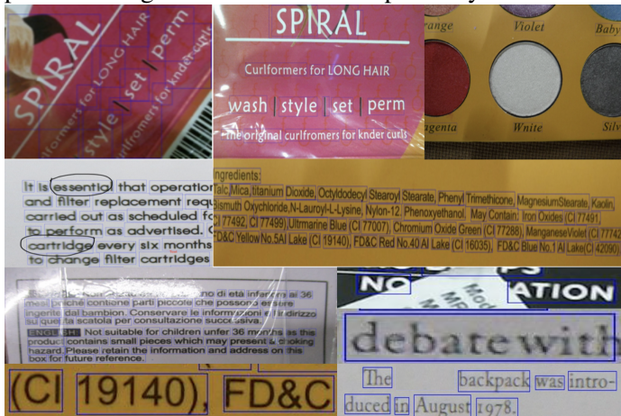
Figure 1: Product Images after OCR processing

This paper aims to automatically and accurately identify misspellings from product images in order to improve customer experience. We loosely define a misspelling as “incorrectly spelled ubiquitous words and proper nouns which are very similar to their correct forms”. Example images and words are present in Figure 1 and Table 1 respectively. As can be seen, product images predominantly contain