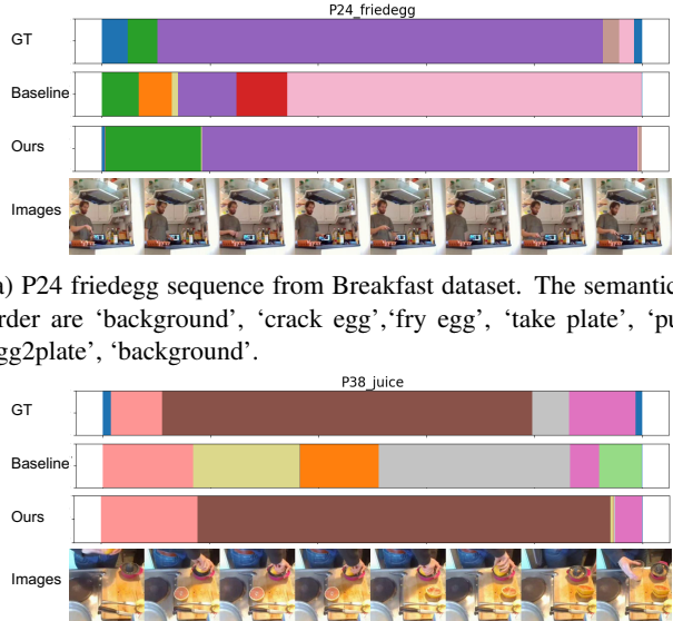
(a) P24 friedegg sequence from Breakfast dataset. The semantics order are ‘background’, ‘crack egg’, ‘fry egg’, ‘take plate’, ‘put egg2plate’, ‘background’.

Fig. 2 visualizes two examples from the Breakfast dataset. From both Fig. 2a and Fig. 2b, we can see that SSCAP is able to notably improve the segmentation quality.