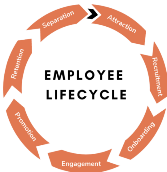
Figure 1: Stages in an employee lifecycle.

Note that HR products are involved in all of these stages of employees' life cycle within the company. An HR product can be a website that helps new hires navigate the activities they must complete when they first join the company, or a website that allows managers to collect the input they need to put one of their direct reports up for a promotion. Research in human resources