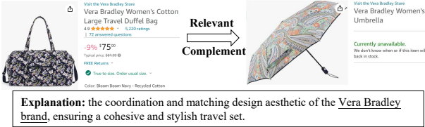
Figure 2: Relevant complementary recommendation example.

the umbrella has the same brand and design style as the handbag, leading to a better match than other candidate umbrella items.