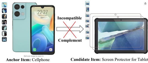
Figure 1: Incompatible complementary recommendation example.