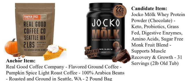
Figure 5: Incorrect coherent complement example from Eq.(1).

A.6.1 Coherent Complement Recommendation Task. We present examples that provide different recommendations among various models. Figure 1 displays an example recommended by the P-companion [1] model, but it is classified as NOT coherent complement by our model. In Figure 5, we provide an example based on Eq.(1), but it is also classified as NOT coherent complement by our model and domain experts. The two items are co-purchased, probably because they are consumable supplies. The same important