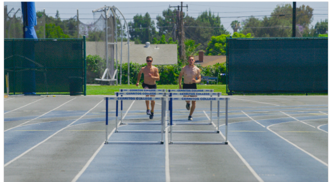
(d) High quality PRC video

Figure 1: Challenges in video quality assessment domain. UGC is more prone to be recorded under unusual fields of view and with lots of camera motion which might cut portions of the scene, while PRC recordings are usually more stable, and focused on the subjects of the scene. (a) shows a low perceived quality UGC video frame due to the recording setting and the presence of distractions (spectators, hand, hand rest); (b) shows a low quality PRC video frame characterized by a stable camera but with a poor motion-capturing system. (c) shows a high quality UGC, recorded from an unusual field of view; while (d) shows high quality PRC which focuses the field of view on the subject. UGC taken from [25], PRC taken from [19].