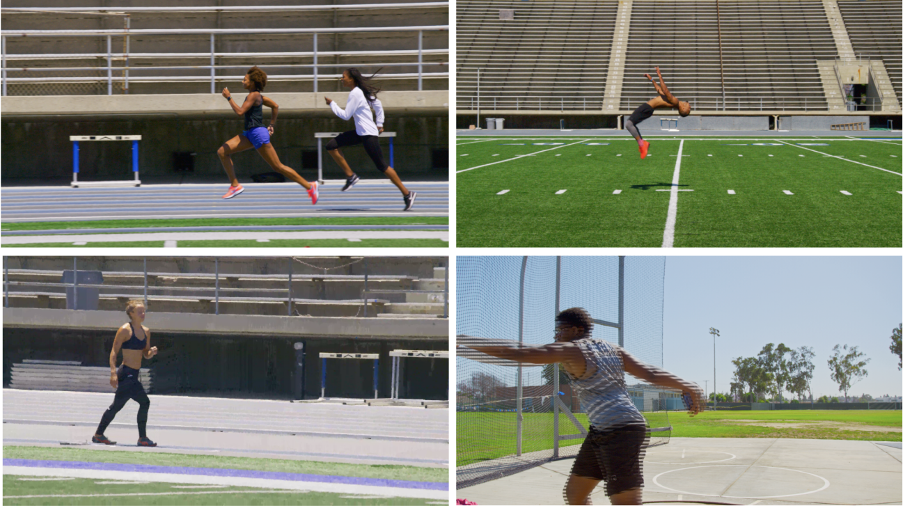
Figure 3: Pristine and defective samples taken from LIVE-APV [19] dataset. From top-left to bottom-right: pristine, pristine, defective (compressions), defective (interlacing). Best viewed in color.