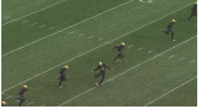
(b) Low quality PRC video