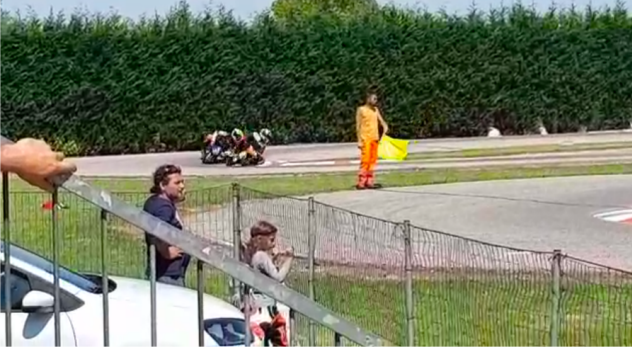
(a) Low quality UGC video