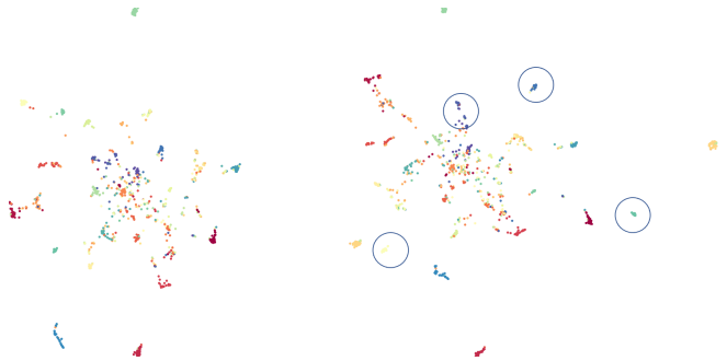
Fig. 2. UMAP [22] visualizations for test sample representations of the first 30 classes on VGGSound from AST (Left) and MAST (Right). MAST extracts semantically more separable representations than AST from the circled classes.

We conduct ablation study w.r.t. the number of pooling operators and pooling strategies on the balanced AudioSet. To compare the architecture without 1D pooling, we employ the 2D pooling in the block 21 and obtain 29.7%, which is probably because we reduce the dimension along the triangular mel-frequency bins dimension too much. We also try to use