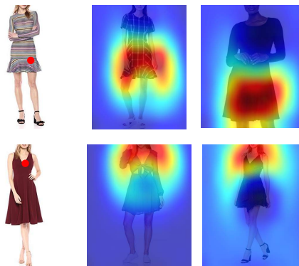
Figure 3. Heatmaps visualizations of queries (left) and database images in top-2 retrievals (right).