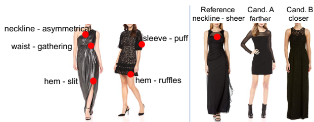
Figure 1. FashionLocalTriplets annotations. Left: prominent attributes. Right: a triplet annotation. Candidate B was marked as more similar to the reference with respect to the interest point.

In this work, we explore the task of fashion retrieval, defined as learning of a clothing-specific embedding space. Existing methods define the concept of similarity at a global image level [12, 10, 15, 23, 7, 31]. Such methods struggle when dealing with fine-grained visual differences between clothes, especially in the case when they are localized. To deal with this problem, we propose a fine-grained localized notion of similarity where the similarity is defined on the interest point level of prominent visual features of a garment. This allows the method to focus on desired localized cues, such as specific sleeve types, necklines, and design patterns